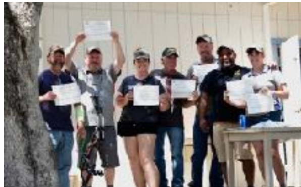
Cascade Region Region Perpetual Trophy Winners