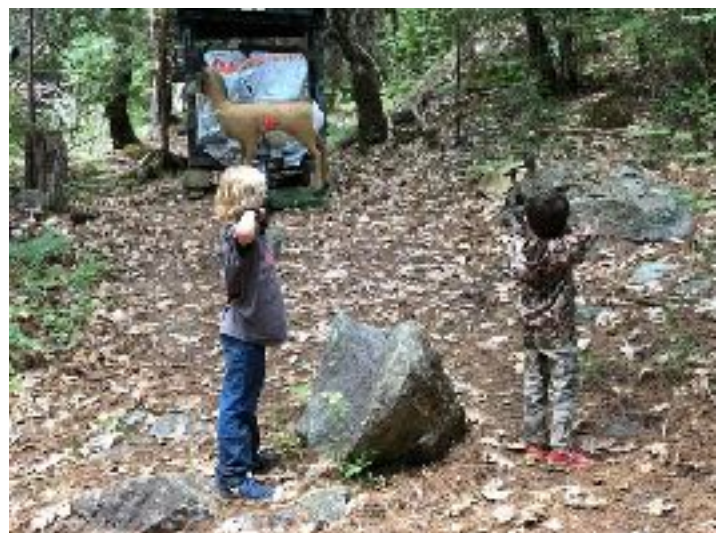
Two young shooters take aim on the Field Round.