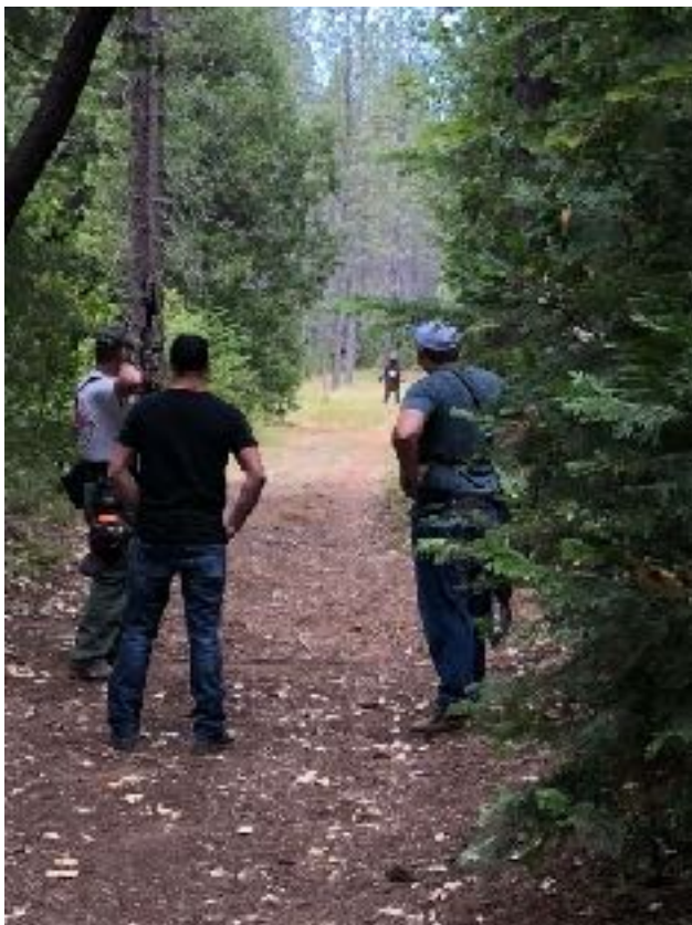
Shooters take a quick break and shoot at our Bear clout!