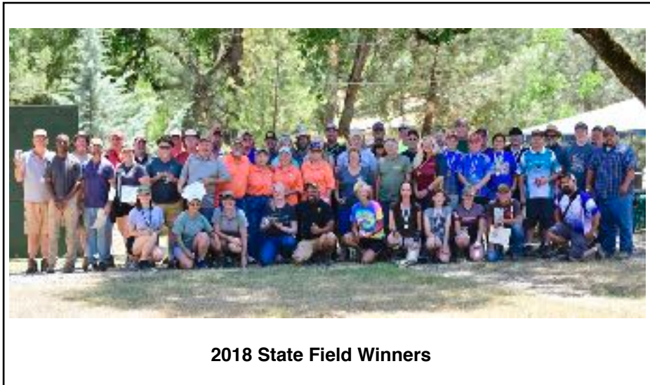
2018 State Field Winners