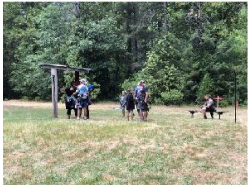
Shooters head down to check out scores for the 82 yard Moose target on our Animal Round.